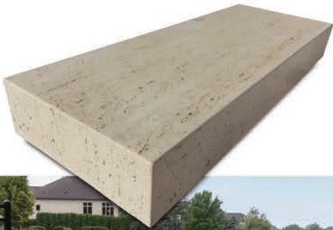
Step (Ivory or Natural)