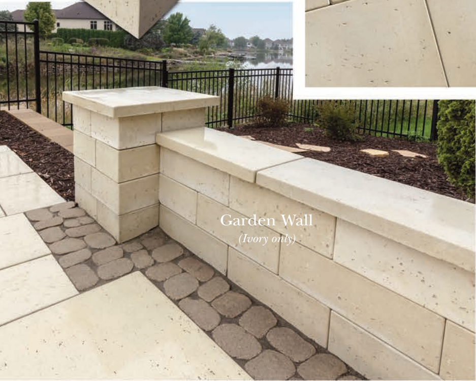
Garden Wall (Ivory only)